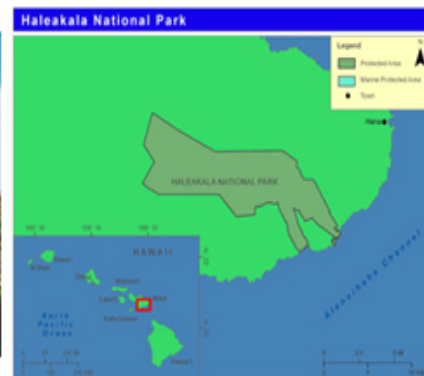
PPA database search results– Haleakala National Park map and photo