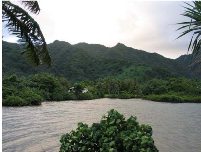
Photographer: A. Baum 2007